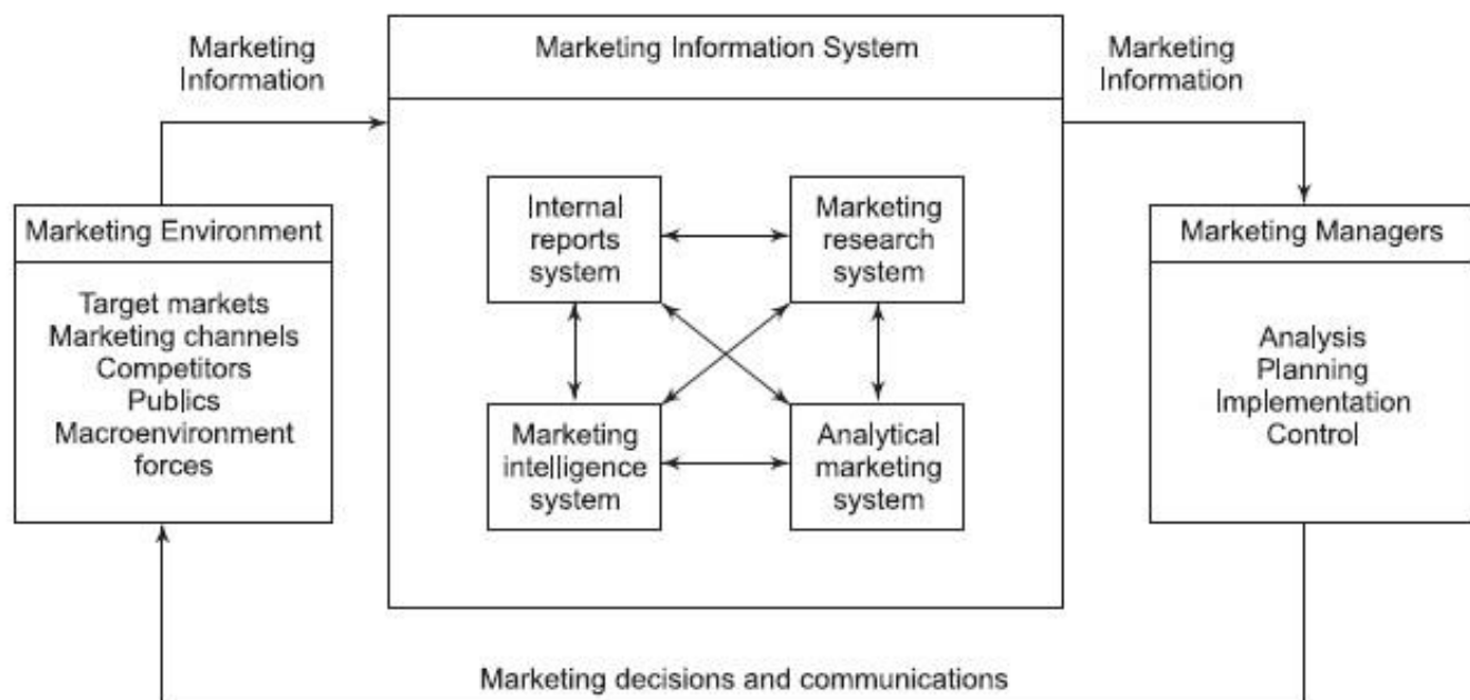
Fig. 1.1 The Marketing Information System

Figure shows the marketing information system (MIS). As can be seen from this Figure, MIS has four sub-systems of which marketing research (MR) is one. Further, each sub-system is linked with the other three and the flow of information is both ways.